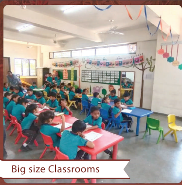
Big size Classrooms