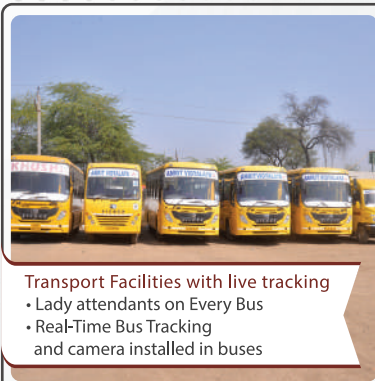
Transport Facilities with live tracking • Lady attendants on Every Bus • Real-Time Bus Tracking and camera installed in buses