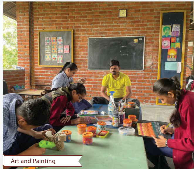
Art and Painting