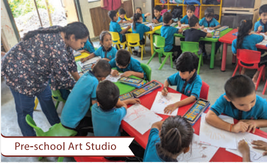
Pre-school Art Studio