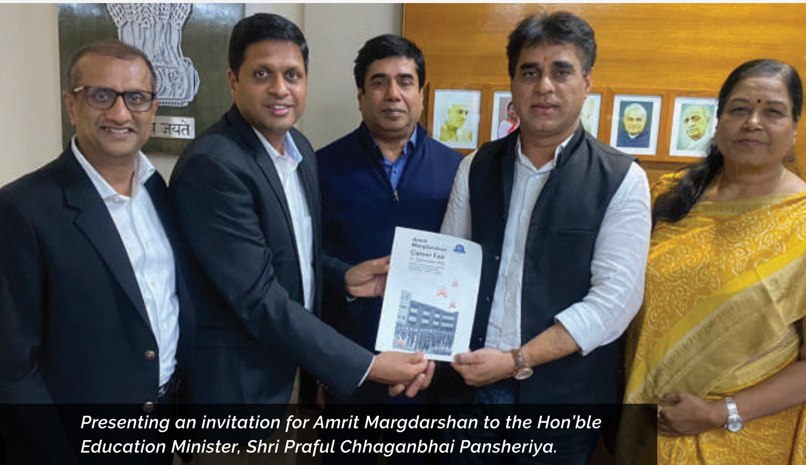
Presenting an invitation for Amrit Margdarshan to the Hon'ble Education Minister, Shri Praful Chhaganbhai Pansheriya.