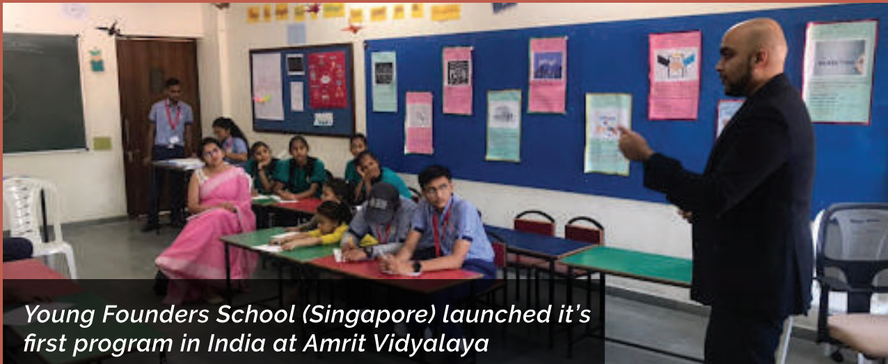
Young Founders School (Singapore) launched it's first program in India at Amrit Vidyalaya