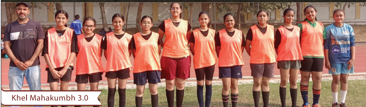
Khel Mahakumbh 3.0

Grade 6 children sparkled at Kala Mahakumbh.