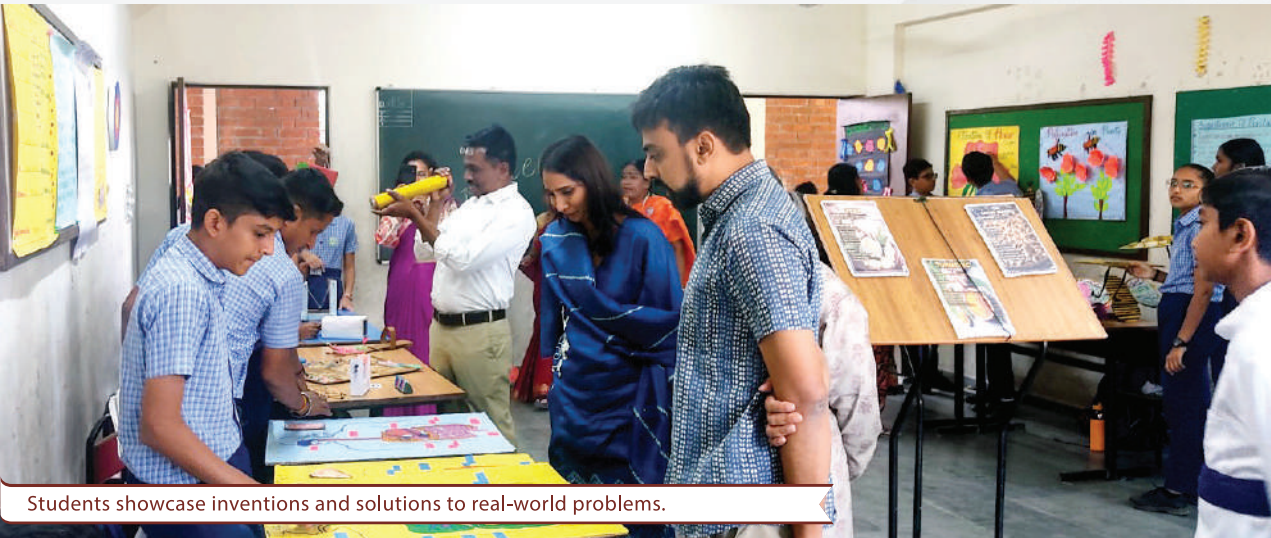
Students showcase inventions and solutions to real-world problems.