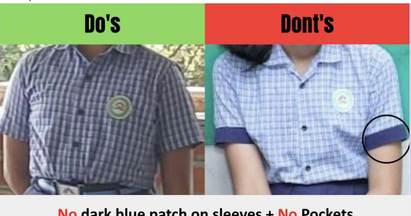
No dark blue patch on sleeves + No Pockets